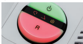
*A4 paper, 70 g/m 2

"EASY_SWITCH": Intelligent multifunction switch element with integrated optical signals for the operational status.